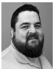
CHRISTIAN SCHELL Christ the Redeemer (formerly Chinook) Local No. 29