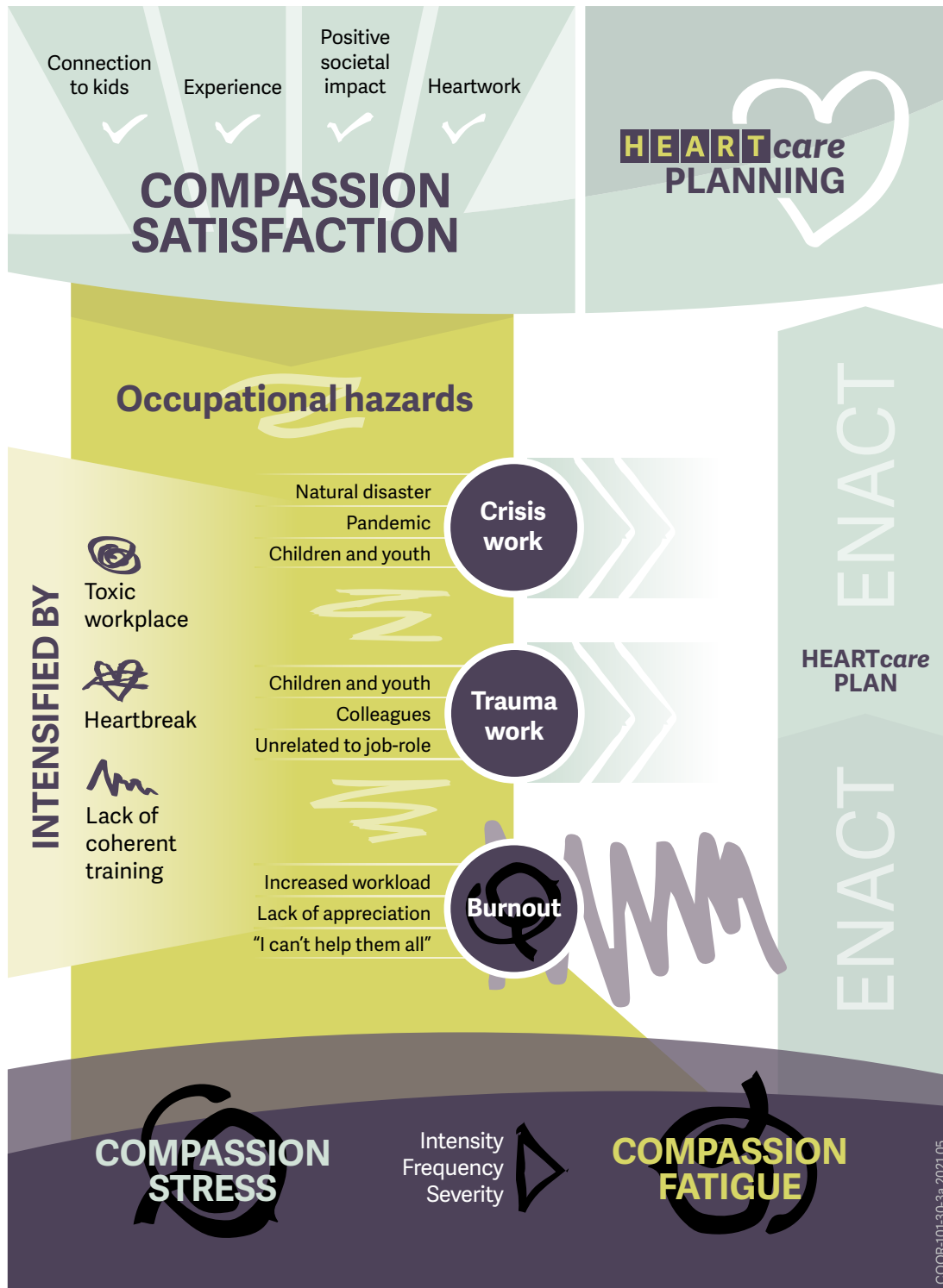
FIGURE 1. Compassion continuum model for education workers