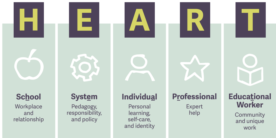
FIGURE 2. HEARTcare planning visual