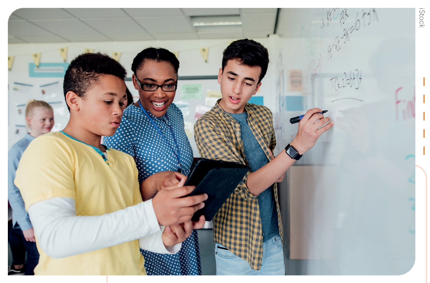
In an inclusive learning environment students are encouraged to achieve their full potential.

Students who are gifted and many who have high ability are capable of mastering the program of studies learner outcomes at a faster pace and a much higher level than the majority of students. While some of these students will be identified as gifted, there are also a large number of students who would benefit from curriculum enrichment. The Teaching Quality Standard requires that teachers plan to address the diverse learning needs in their classroom, use instructional strategies that engage all students, and provide challenging, meaningful learning activities appropriate to learners' capabilities. In an inclusive learning environment where differences are accepted and talents nourished, students are encouraged to achieve their full potential (Alberta Education 2018b). Teachers are also guided by the school jurisdiction's policy and procedures for gifted education.