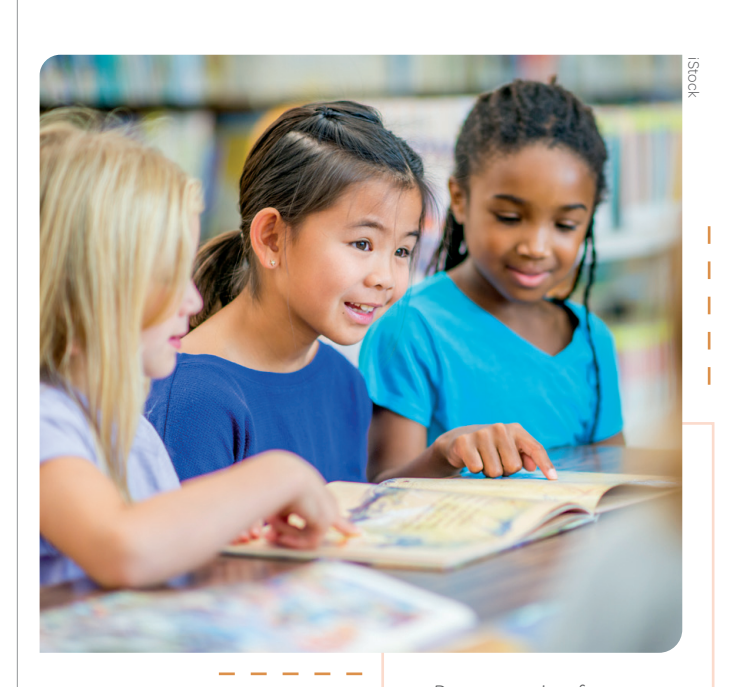
Programming for students who have high ability or who are gifted starts with the provincial program of studies.

Some gifted students can also have learning challenges. The most common learning challenges experienced by gifted children are learning disabilities, attention deficit/hyperactivity disorder and autism spectrum disorder. Twice-exceptional students may have difficulty reaching an academic level that matches their measured potential. As well, dual exceptionalities often mask each other and may be more challenging to diagnose (Alberta Education 2010, 175–76).