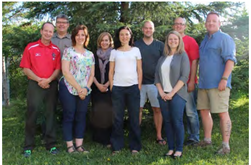
ATA members who took part in the 2016 Project Overseas

Every year, the ATA sponsors ten volunteer teacher members to co-facilitate PD workshops overseas for a three-week period during the summer. Since 1962, 291 volunteers from the ATA have participated in 450 missions, working with other Canadian teachers and with teacher colleagues in other countries. Many current projects throughout Africa and the Caribbean include, but are not limited to, literacy acquisition, gender equality, special education and peace education, as well as the core subject areas of English, Math, Science and Social Studies, within a child-centered methodology.