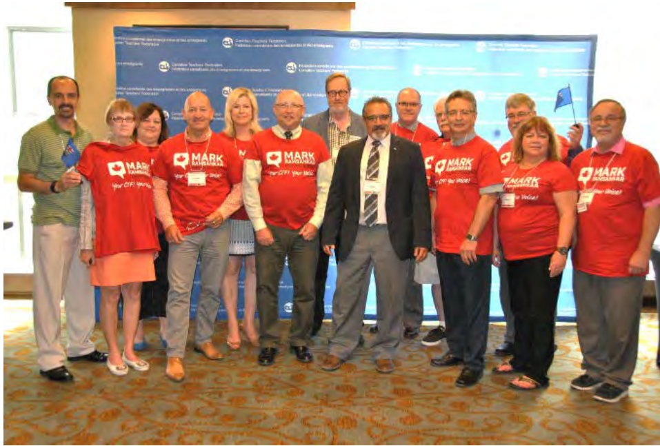
ATA Delegation at the 2016 CTF Annual General Meeting in Montreal

CTF events provide opportunities for ATA representatives to meet with their provincial, territorial and international counterparts to discuss professional and labour issues of common concern, and participate in decisions for action.