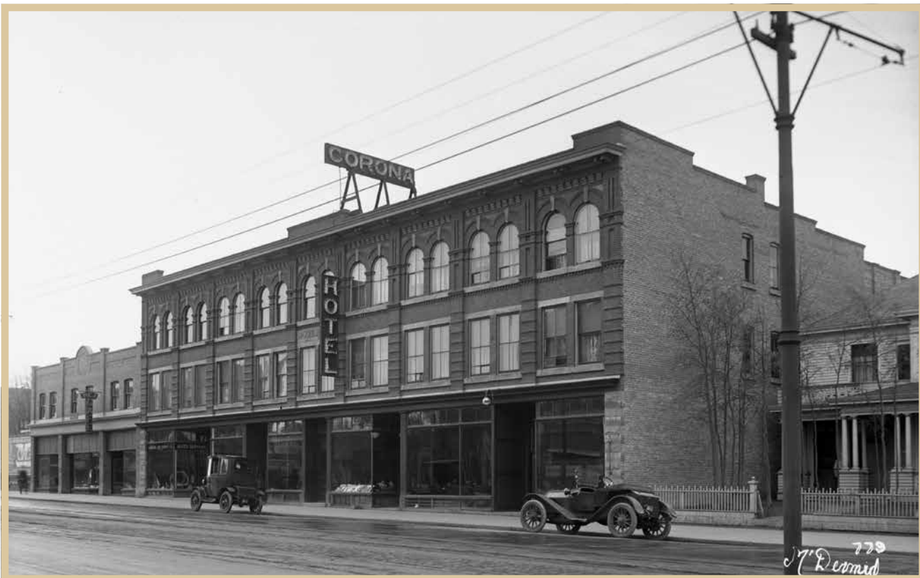
Corona Hotel, Edmonton, circa 1920