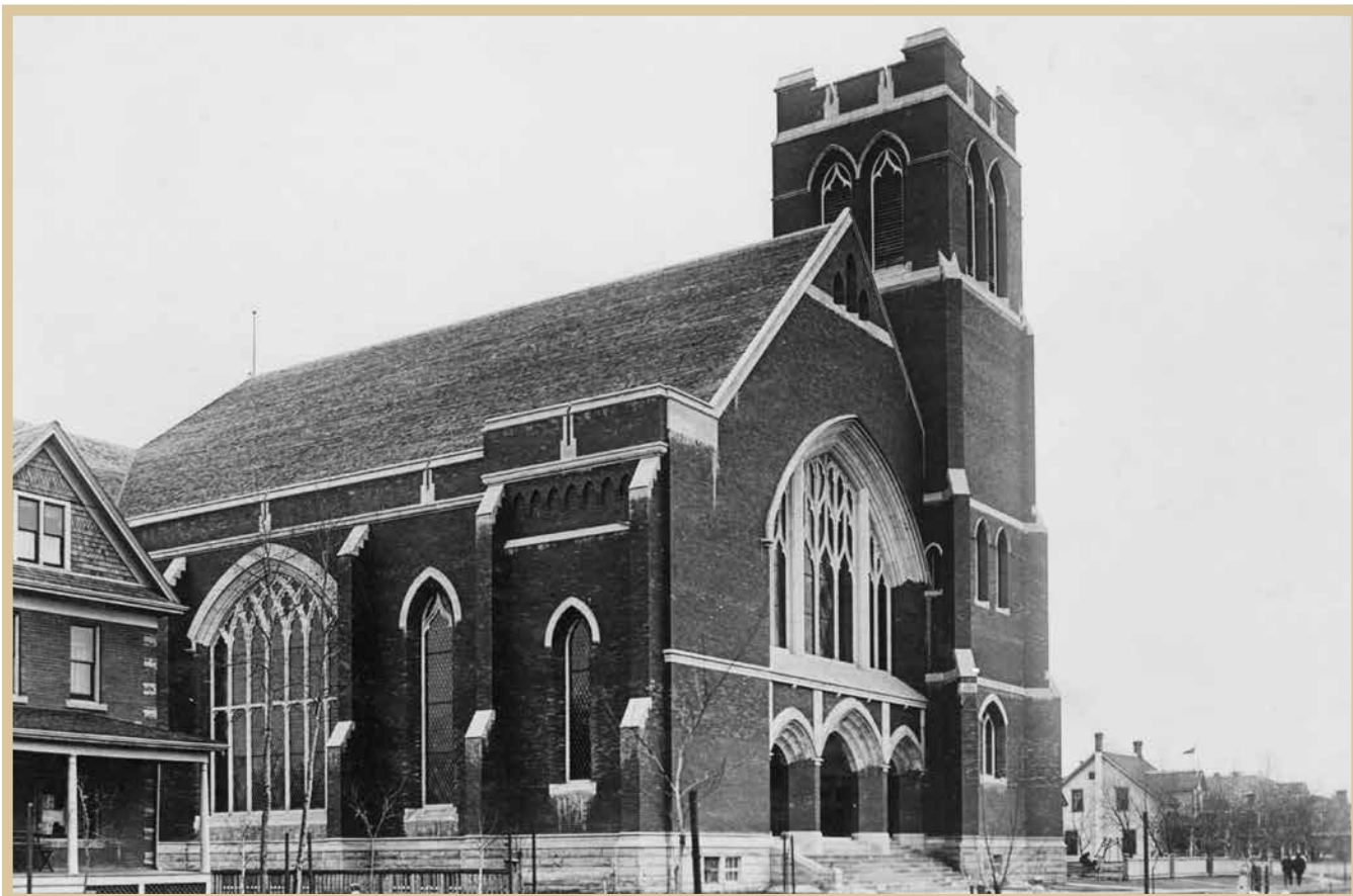
First Presbyterian Church, Edmonton, circa 1920